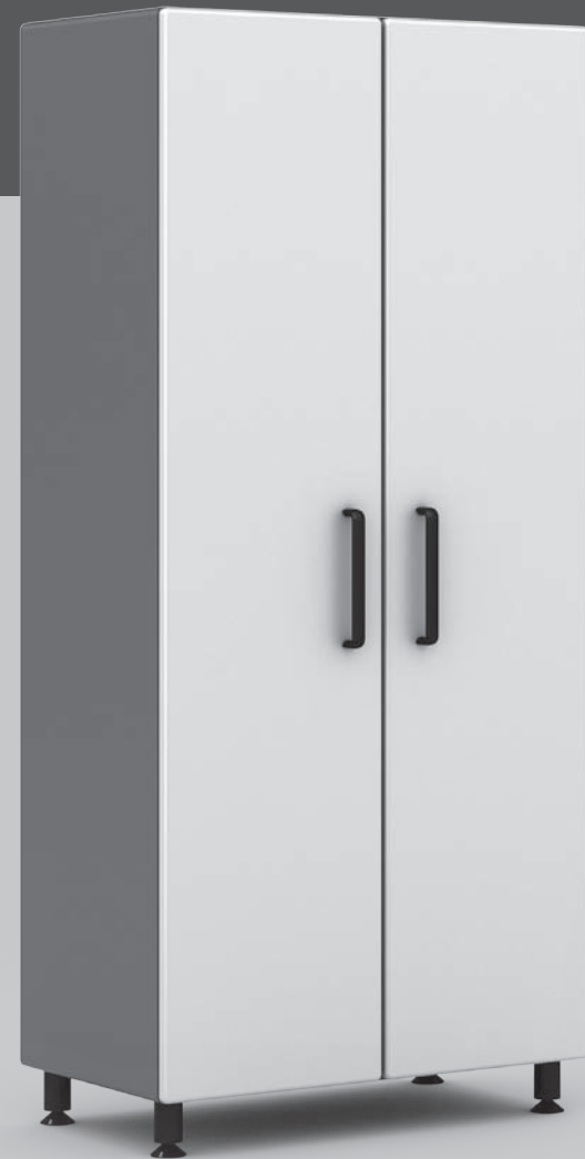
GA-21MT 30"[w] - 76"[t] - 21"[d] Large 2 Door Storage Cabinet

visit: www.ulti-matestorage.com for more info