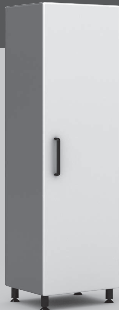
GA-22MT 23.5"[w] - 76"[t] - 21"[d] Medium 1 Door Storage Cabinet