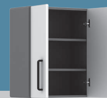
1 Fixed/1 Adjustable Shelf

visit: www.ulti-matestorage.com for more info