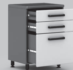
Pre-installed Drawer Glides for Easy Assembly