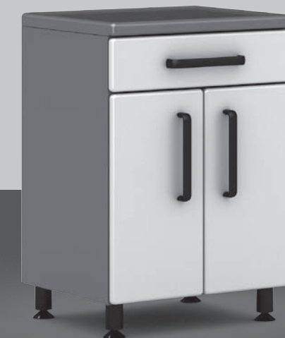
GA-27MT 23.5"[w] - 35"[t] - 21"[d] 1 Drawer/2 Door Base Cabinet