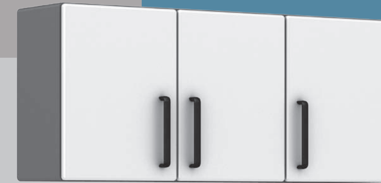
GA-08MT 54"[w] - 24"[t] - 12.5"[d] Wide 54" Hanging Wall Cabinet 1 Adjustable Shelf

Easily hangs to take clutter off the floor