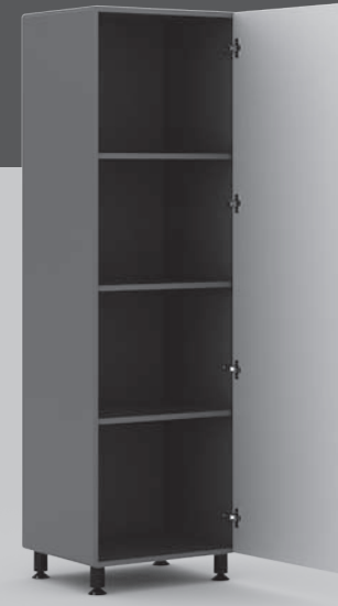
1 Fixed / 2 Adjustable Shelves