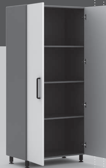
1 Fixed / 2 Adjustable Shelves