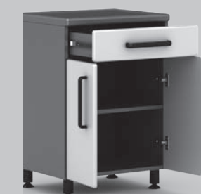
1 Adjustable Shelf