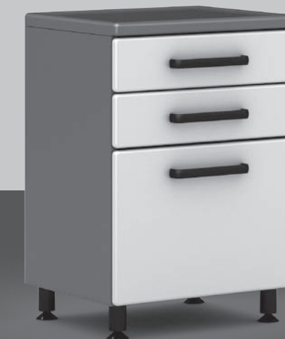
GA-04MT 23.5"[w] - 35"[t] - 21"[d] 3 Drawer Base Cabinet