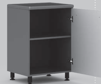
1 Adjustable Shelf