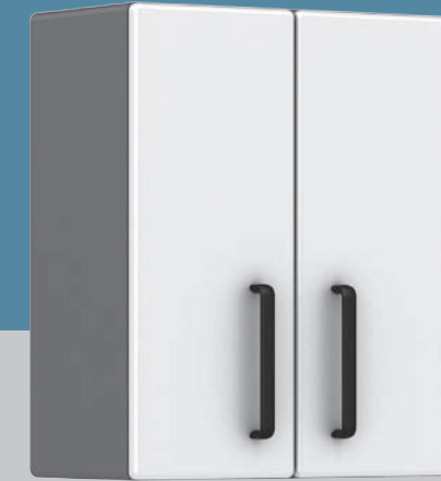
GA-09MT 23.5"[w] - 30"[t] - 12.5"[d] Tall 30" 2 Door Hanging Wall Cabinet