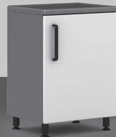
GA-02MT 23.5"[w] - 35"[t] - 21"[d] 1 Door Base Cabinet

Versatile units to meet all your storage needs