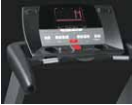
SK9100 LED Monitor